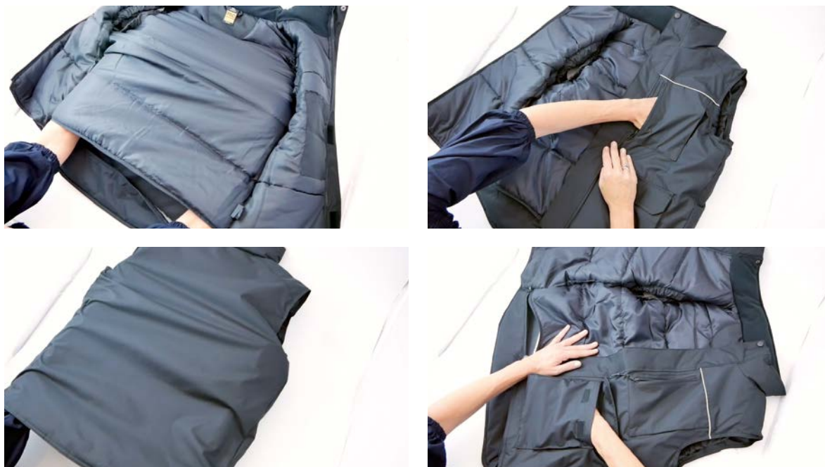
Zip opening at the bottom of the lining.