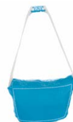
Inside out pocket when the jacket is folded in (K-Way® system)